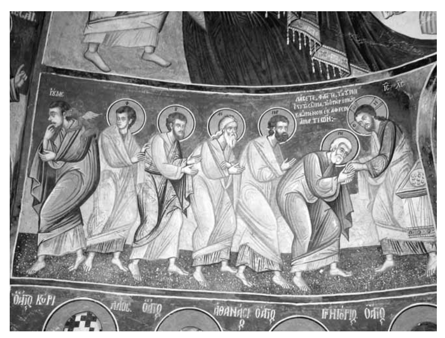
6. The Communion of Apostles. The church of SS. Peter and Paul (1764), Vithkuqi.