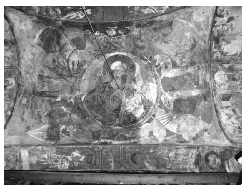
7. The God Sabbaoth. The church of St. Nicholas (1726), Moschopolis.