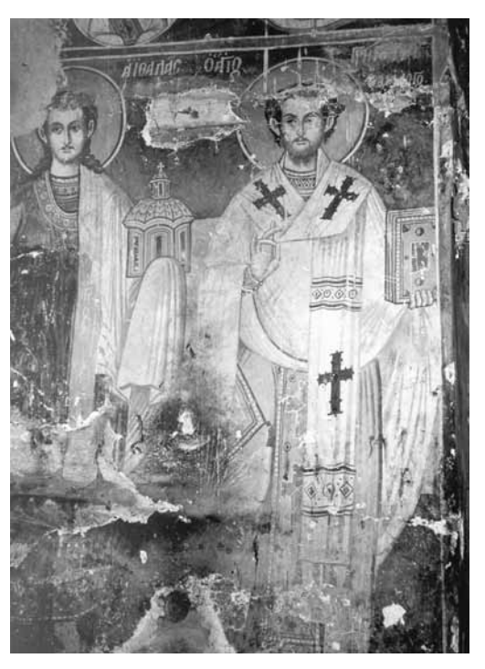
16. St. Aitalas and St. Gregory Dialogos. The church of SS. Peter and Paul (1764).