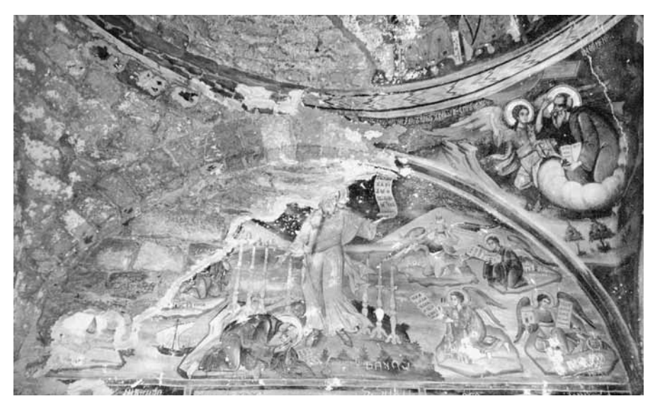
17. Apocalypses (1:12-18). The church of St. Nicholas (1750), Moschopolis.