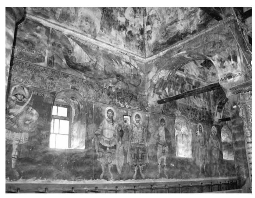
14. Saints and Scenes from St. Nicholas Vita. The church of St. Nicholas (1726), Moschopolis.