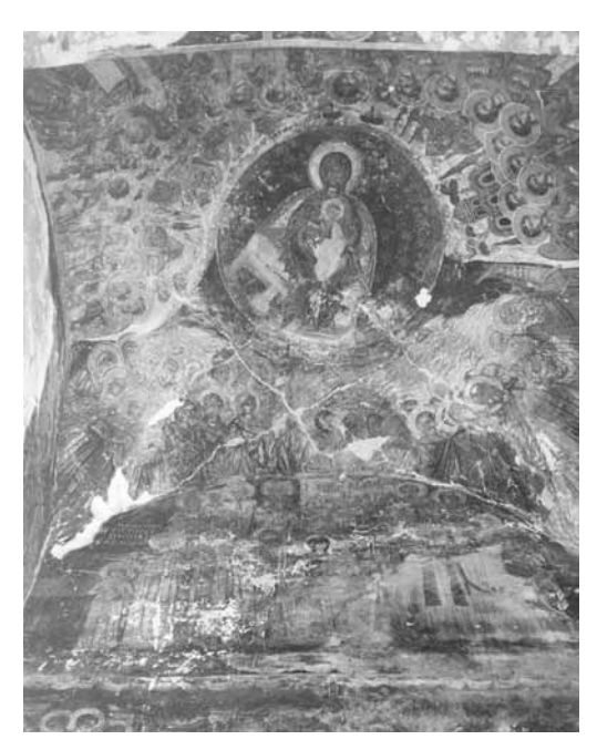
10. In Thee Rejoiceth and The Orthodox Sunday. The church of Dormition of Holy Virgin (1712), Moschopolis.