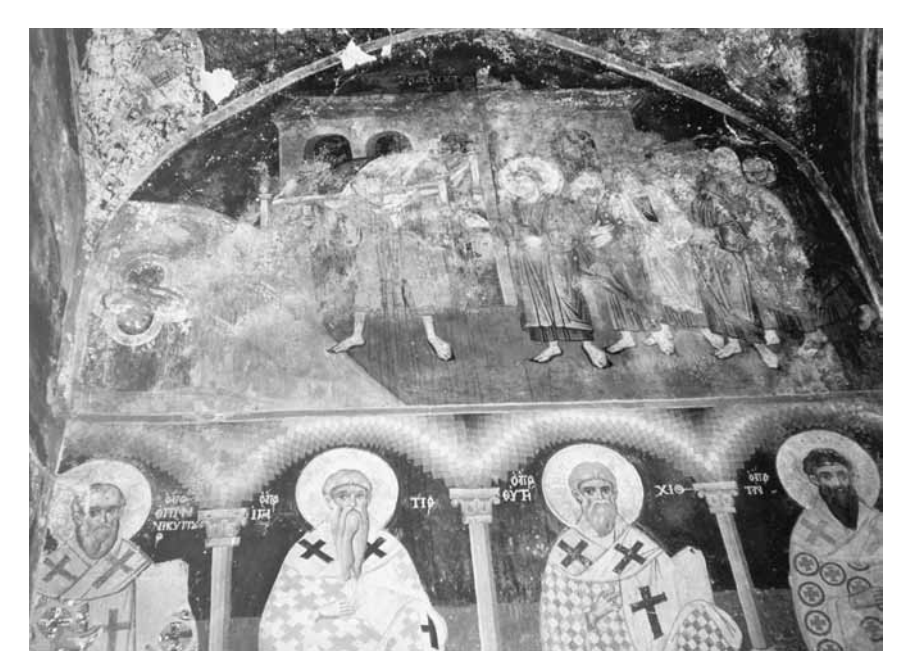
15. Saints and the Healing of the Paralytic. The church of St. Nicholas (1726), Moschopolis.