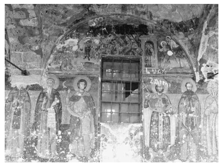
18. Saints and Apocalypses. The church of St. Nicholas (1750), Moschopolis.