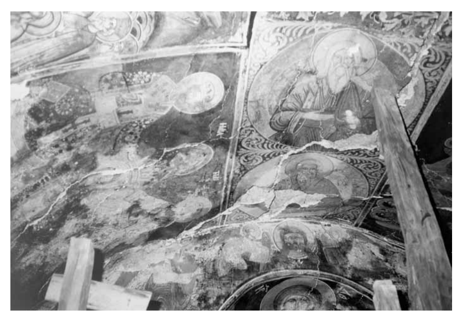
5. The Three-Faced Christ and The Crowning of the Holy Virgin. The chapel of SS. Cosmas and Damian (1750), Vithkuqi.