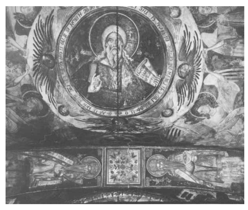
8. The God Sabbaoth. The church of St. Athanasios (1745), Moschopolis.