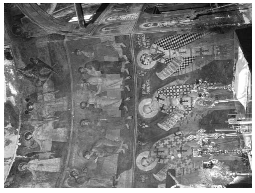
3. The Apse. The church of St. Nicholas (1726), Moschopolis.