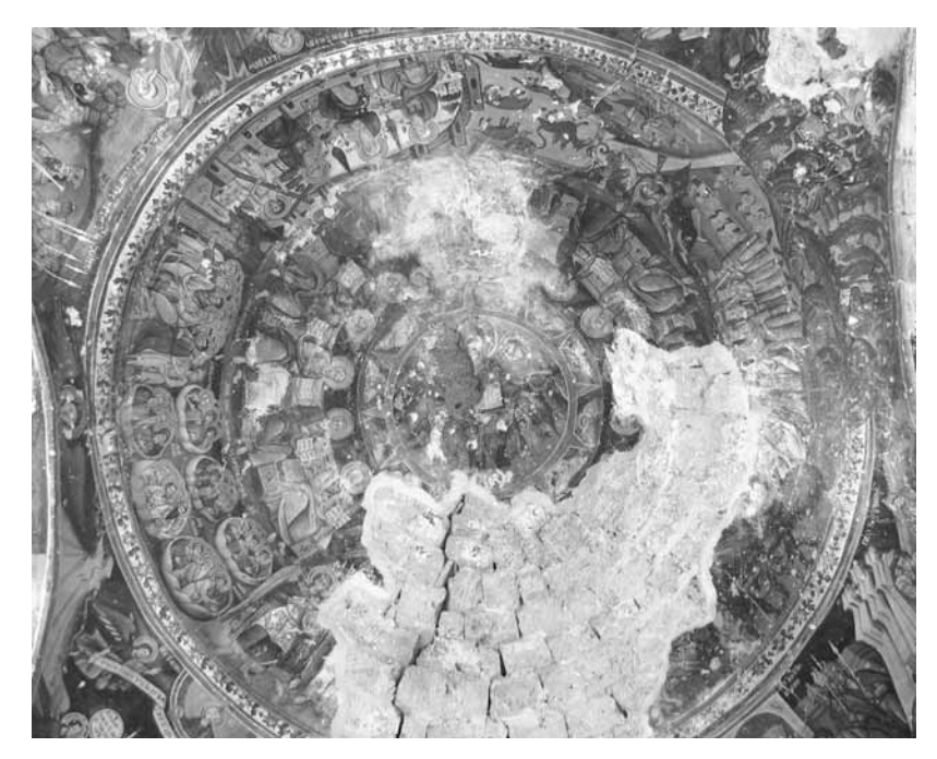
19. The Last Judgement. The church of SS. Peter and Paul (1764).